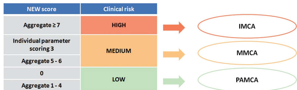
Fig 1. Patient placement in relation to three categories of clinical risk as assessed by NEWS [11]. At admission, patients were addressed to IMCA (Intermediate Medical Care Area) or MMCA (Medium Medical Care Area) according to individual level of risk. The Post-Acute Medical Care Area (PAMCA) served as pre-discharge area for step-down patient.

We collected data from the Hospital Information System. To protect patient privacy all data were anonymized before analyses and patient informed consent was collected. Since we did not manage sensitive data, according to the rules of the Healthcare Trust of the Autonomous Province of Trento, ethical committee approval was not needed. The following variables